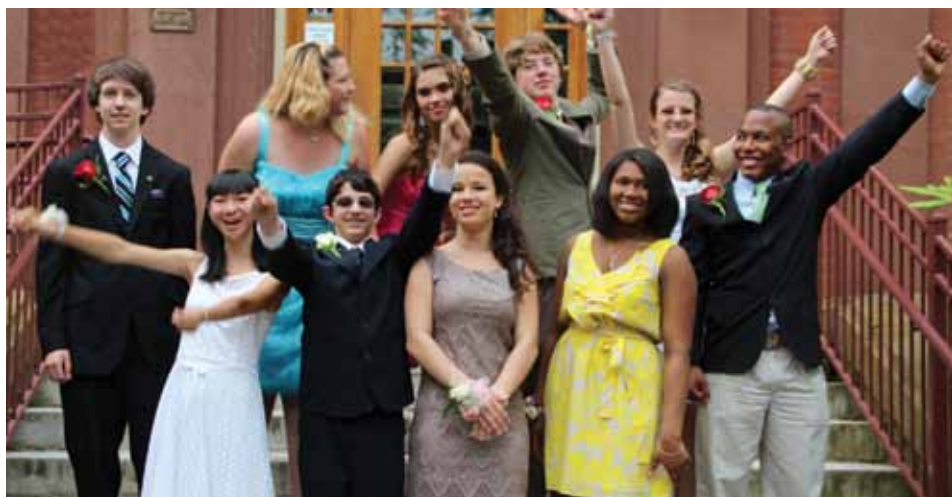
Clarke's 2012 Eighth-Grade Class